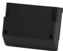
Smart Card / MSR