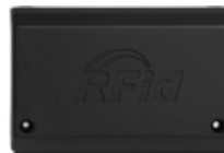
HF RFID Reader